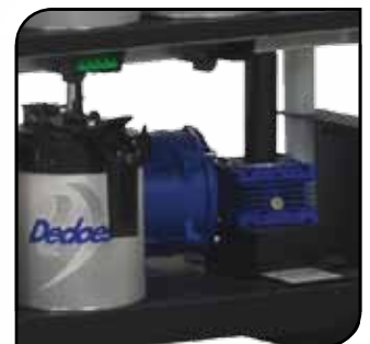
Gear-reduced drive system is quiet and durable

Dedoes U.S. - Headquarters 1060 W. West Maple Rd. Walled Lake, MI 48390 For technical support on our products or additional accessories, Please call us at 248-624-7710 or visit our web site: www.dedoes.com