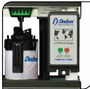
Operates with an on/off push button timer