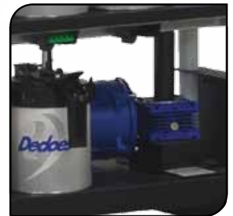
Gear-reduced drive system is quiet and durable

Dedoes U.S. - Headquarters 1060 W. West Maple Rd. Walled Lake, MI 48390 For technical support on our products or additional accessories, Please call us at 248-624-7710 or visit our web site: www.dedoes.com