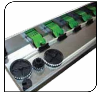
Only five moving parts per shelf

No tools required with the twist and lock system